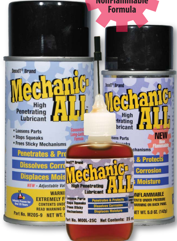
Part No. M20S-9 Flushing Action Net Wt. 255 g Part No. M100L-25C Non-Flammable Net Wt. 25 mL Part No. M20S-6N Non-Flammable Net Wt. 142 g