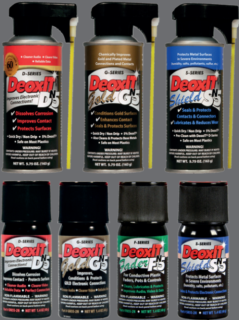
Honeywell Solstice propellant is used in seven CAIG DeoxIT products.